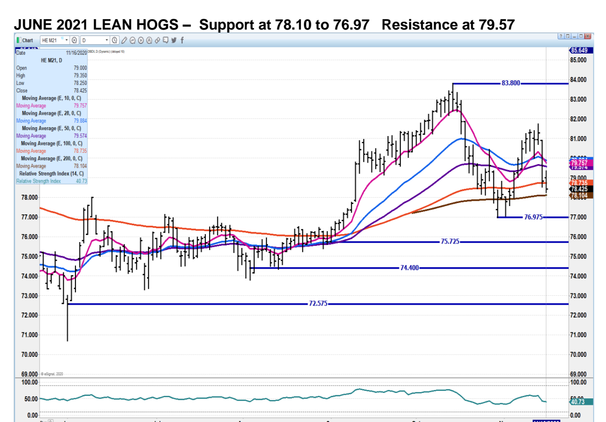
CHARTS FROM ESIGNAL INTERACTIVE, INC.