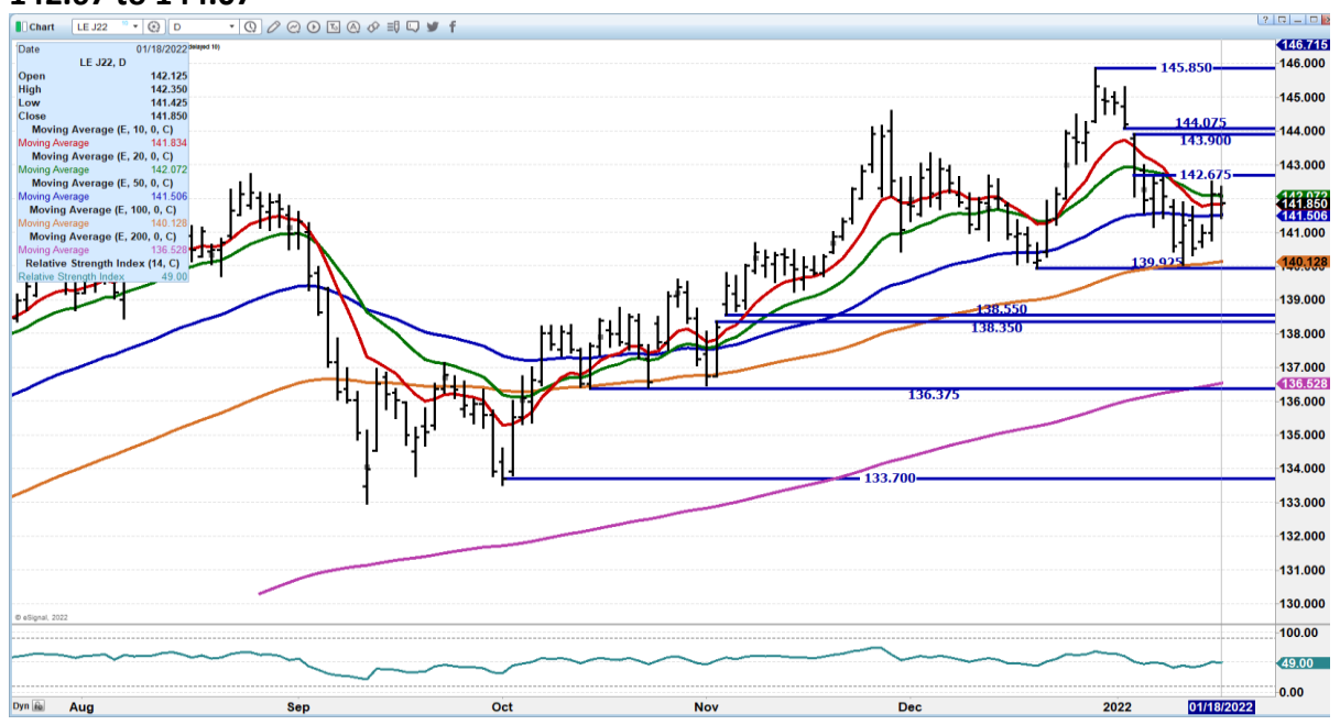
APRIL 2022 LIVE CATTLE - Volume at 20,493 Support at 140.10 to 136.50 Resistance at 142.67 to 144.07

FEBRUARY 2021 LIVE CATTLE - Volume at 12,225 Resistance at 138.87 Support at 137.50 to 136.55