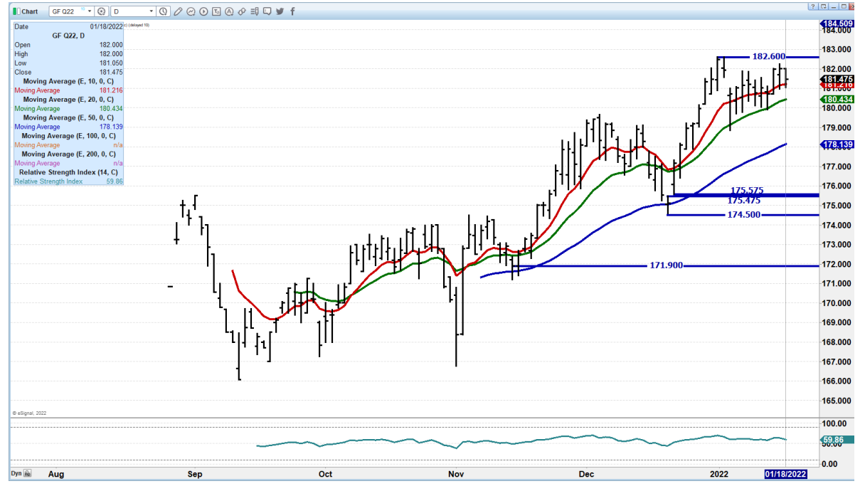
AUGUST 2022 FEEDER CATTLE - RESISTANCE AT DOUBLE TOP AT 182.60 SUPPORT AT 180.37