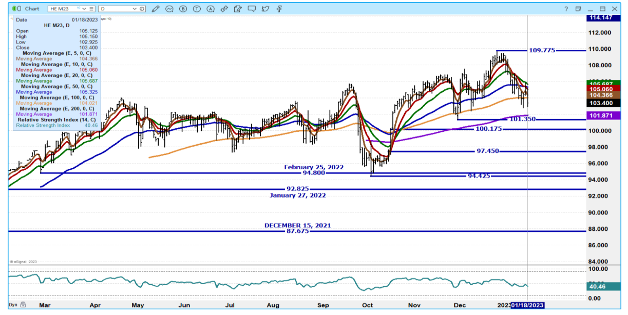
JUNE 2023 LEAN HOGS - VOL 8712 SUPPORT AT 101.87 TO 100.17 RESISTANCE AT 105.10 TO 105.75