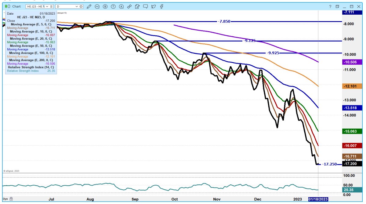
FEBRUARY 2023 LEAN HOGS - VOLUME AT 20,367 SUPPORT AT 77.27 TO 76.40 RESISTANCE AT 78.60 TO 80.25