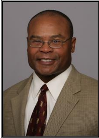
MIKE SINGLETARY | NFL Football Coach, Former Player, Hall of Famer

Mike Singletary is perhaps most recognized as one of the Chicago Bears' toughest middle linebackers with the ferocious eyes peering across the line into the opposing quarterback's face. He was a member of the famed '85 Super Bowl team and made 10 trips to the Pro Bowl in his 12 years as a player. He also led the NFL as Defensive Player of the Year three times, and was the Bears' team captain for ten years.