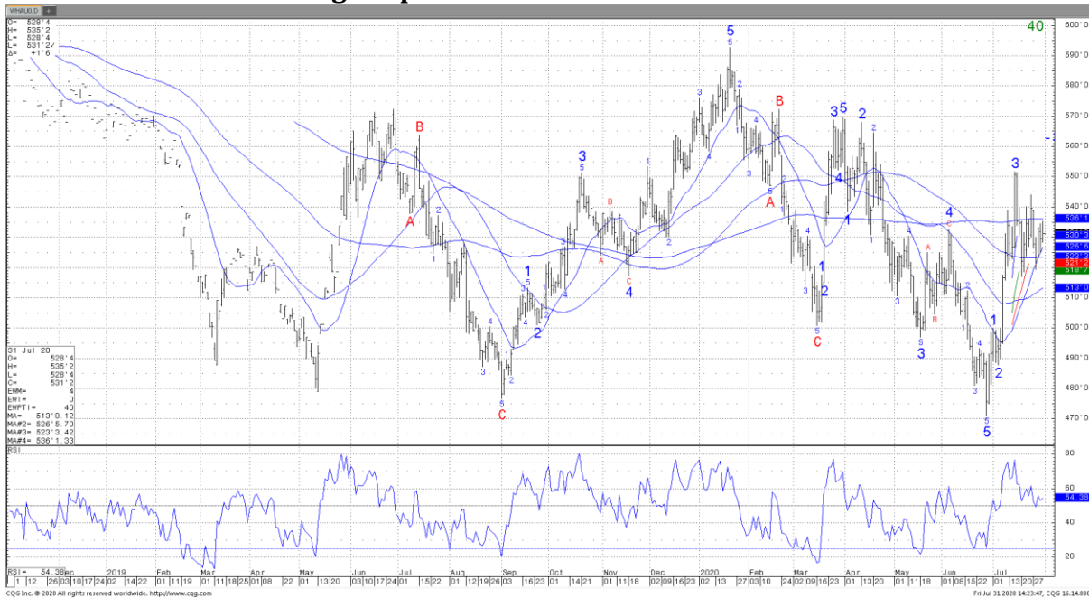
Chicago September wheat futures chart

Wheat futures managed small gains. September Chicago wheat futures continues to hang around 5.40 resistance. Talk of slow farmer selling in EU and Russia plus talk of lower supplies there offers support. Dryness in Argentina is also supportive. Still, talk of lower World demand due to Covid offers important resistance. Many North Africa countries rely in tourist income to buy imported goods. For many that income stopped when virus was first detected and continues as virus spreads. Lower corn prices should weigh on wheat futures. So far, lower US Dollar is not helping demand for US wheat exports. US winter wheat harvest is almost done. Demand for both US SRW and HRW remains slow. This week's US HRW sales to Brazil could tighten supply if continued. US spring wheat crop showed improvement. EU trimmed their 2020 crop size. Russia spring wheat crop areas continue to see mostly dry weather. Yields are improving as Russia winter wheat harvest advances. Argentina announced lower planted wheat acres due to dryness.