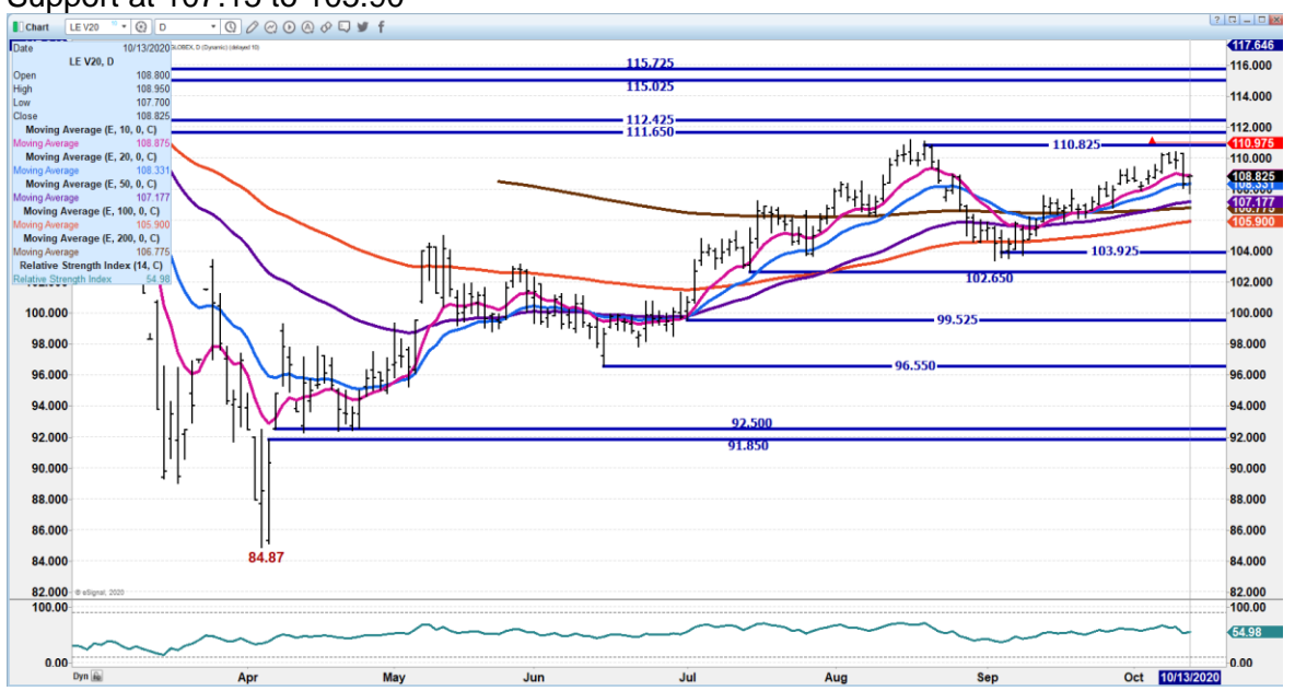
DECEMBER 2020 LIVE CATTLE – Resistance at 111.75 to 114.02 Support at 109.35 to 107.25. Volume at 26,321