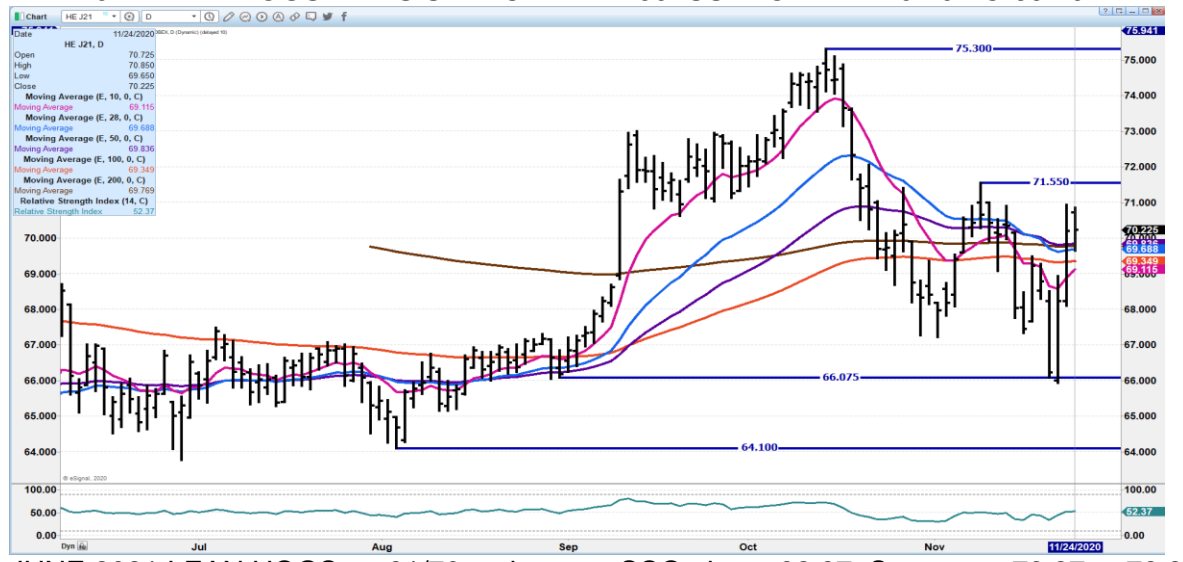
JUNE 2021 LEAN HOGS - 81/70 resistance. SCO above 82.87 Support at 79.87 to 78.80