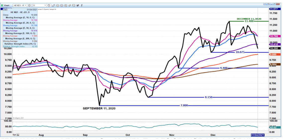
FEBRUARY 2021 LEAN HOGS – MOVED TO RESISTANCE AND LAST HIGH AT BACK AT OCT 6. RESISTANCE IS 72.00 TO 72.57 SUPPORT AT 70.50 TO 68.07