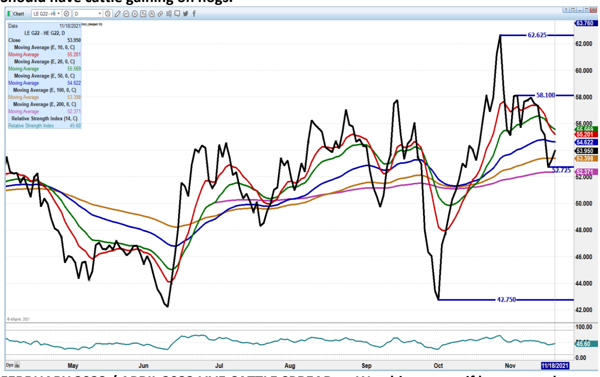
FEBRUARY 2022 / APRIL 2022 LIVE CATTLE SPREAD – Watching to see if bear spread