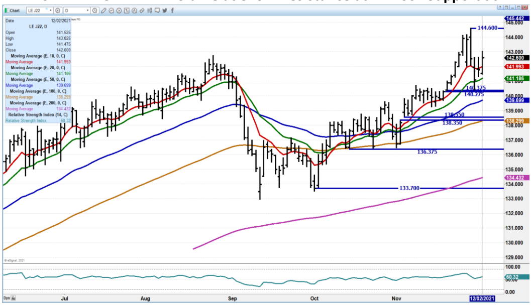
APR 2022 LIVE CATTLE – volume at 8732 Resistance at 144.60 Support at 141.15 to 139.70