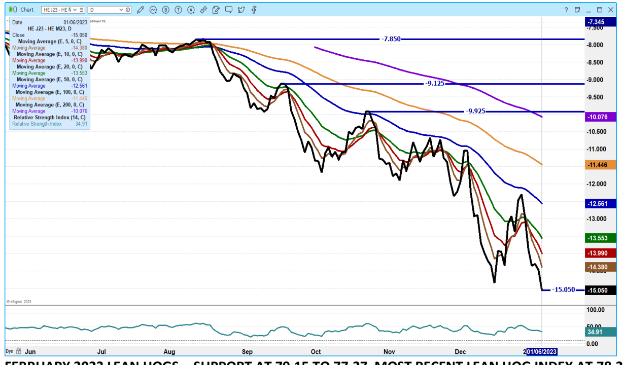
FEBRUARY 2023 LEAN HOGS - SUPPORT AT 79.15 TO 77.27 MOST RECENT LEAN HOG INDEX AT 78.26 RESISTANCE AT 83.45 TO 85.10 VOLUME AT 29,988