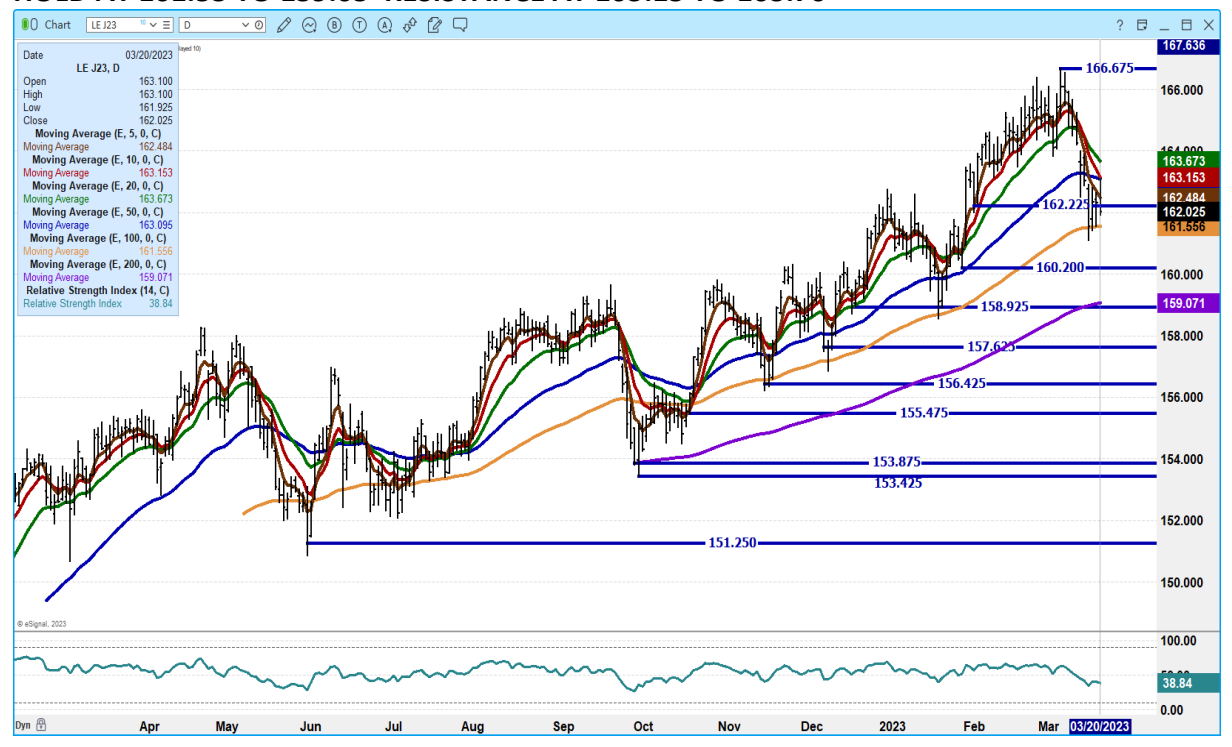
APRIL 2023 LIVE CATTLE – VOLUME AT 11673 OPEN INTEREST AT 55501 SUPPORT NEEDS TO HOLD AT 161.55 TO 159.05 RESISTANCE AT 163.15 TO 163.70