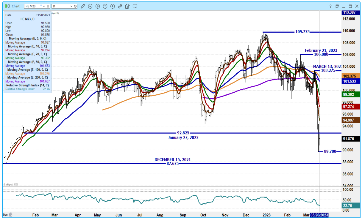
JUNE 2023 LEAN HOGS - VOLUME AT 24458 SUPPORT AT 89.70 TO 87.67 REISTANCE AT 95.00