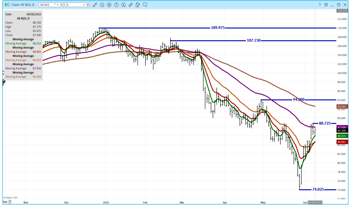
JULY 2023 LEAN HOGS - VOL AT 27865 RESISTANCE AT 87.97 TO 92.55 SUPPORT AT 86.02 TO 84.65