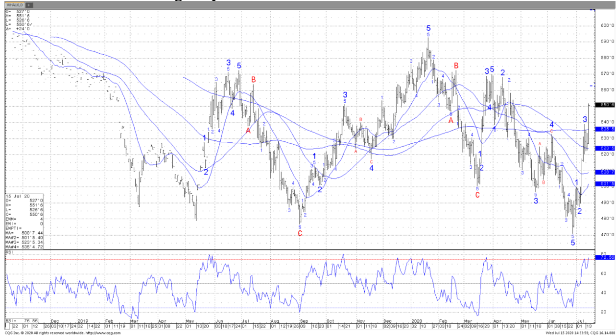
Chicago September wheat futures chart

Wheat futures jumped higher on new speculative buying following rumors of China buying a few cargoes of US SRW wheat. Late June low was near 4.70 WU. Market began to rally on talk of lower Europe and Russia wheat crops. Russia domestic flour prices rallied on tight supply. WU followed to near 5.20. Domestic US users have been buying mostly hand to mouth given the uncertainty over demand due to the virus. Reopening restaurants offered support but resurgence of the virus adds uncertainty to future demand. Higher French wheat prices offered support this week despite slow start the World trade. Rumors of China buying US SRW Wheat helped rally prices today to near 5.50. January highs were near 5.90 WU. Weekly US wheat export sales are estimated near 250-650 mt versus 326 last week.